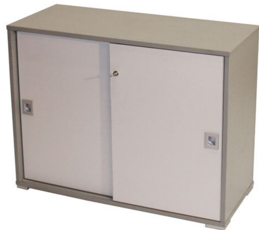
N. 1 cabinet