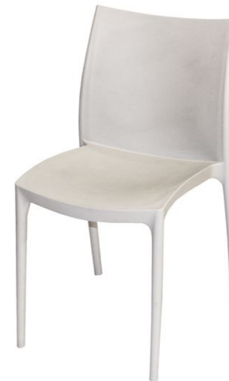
N. 3 plastic chairs, white colour