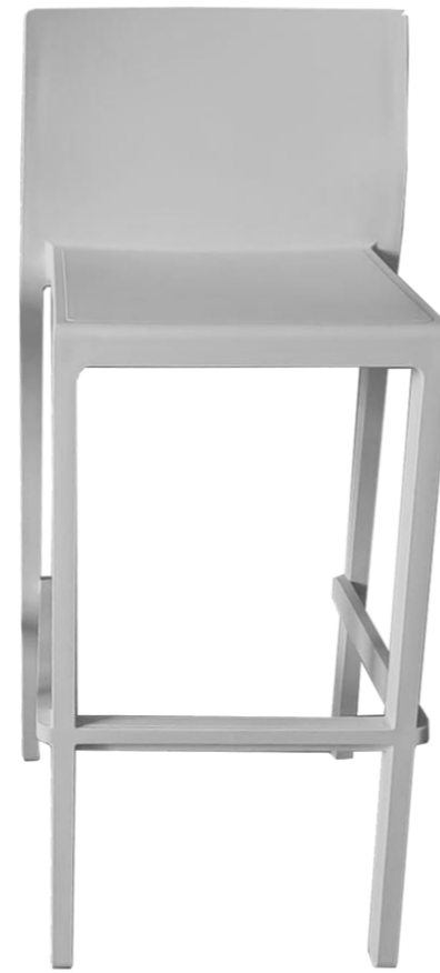
N. 1 stool, white colour