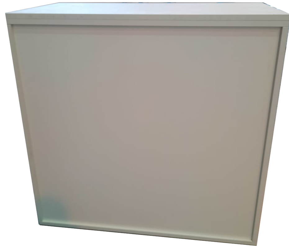
N. 1 laminate desk, white colour, whit lockable shutters