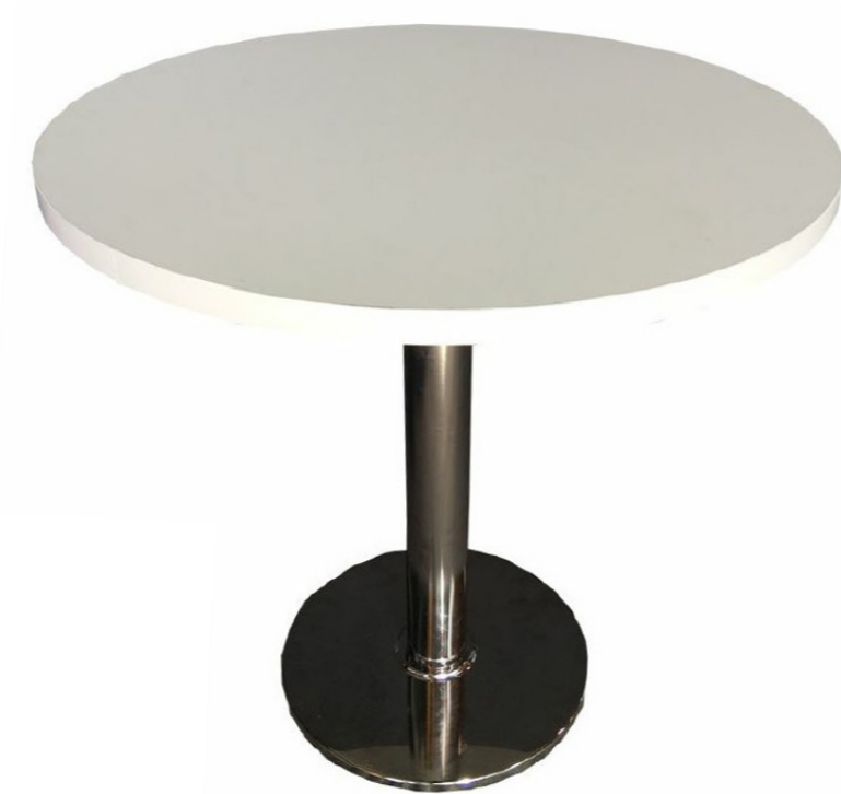
N. 1 table